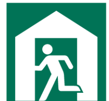
Evacuation Center Symbol